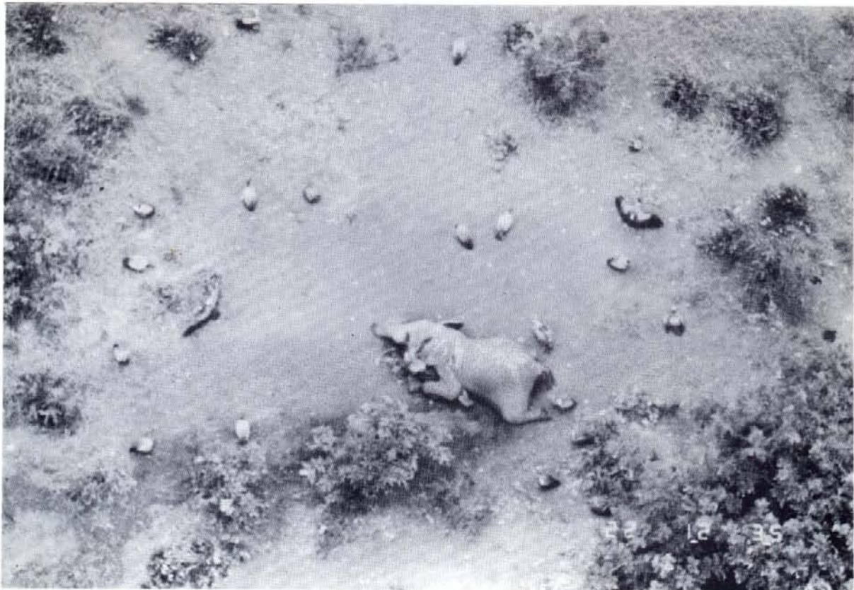
Below: A freshly killed elephant (2-3 days), surrounded by vultures. A recent survey reckoned that two Central African Republic wildlife parks contained 4,300 live elephants - and about 7,900 dead ones.