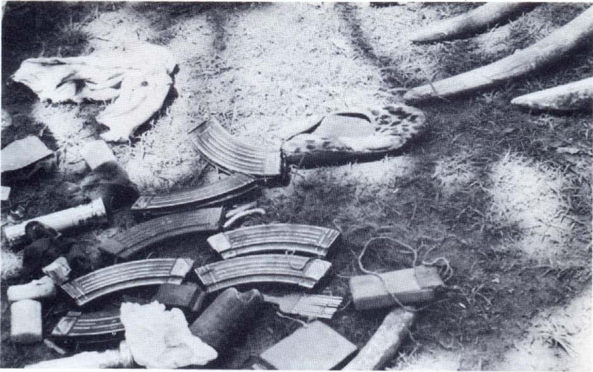
Above: Magazines from the Kalashnikov automatic rifles and personal effects used by ivory poachers from Sudan in the attack on the president's helicopter.