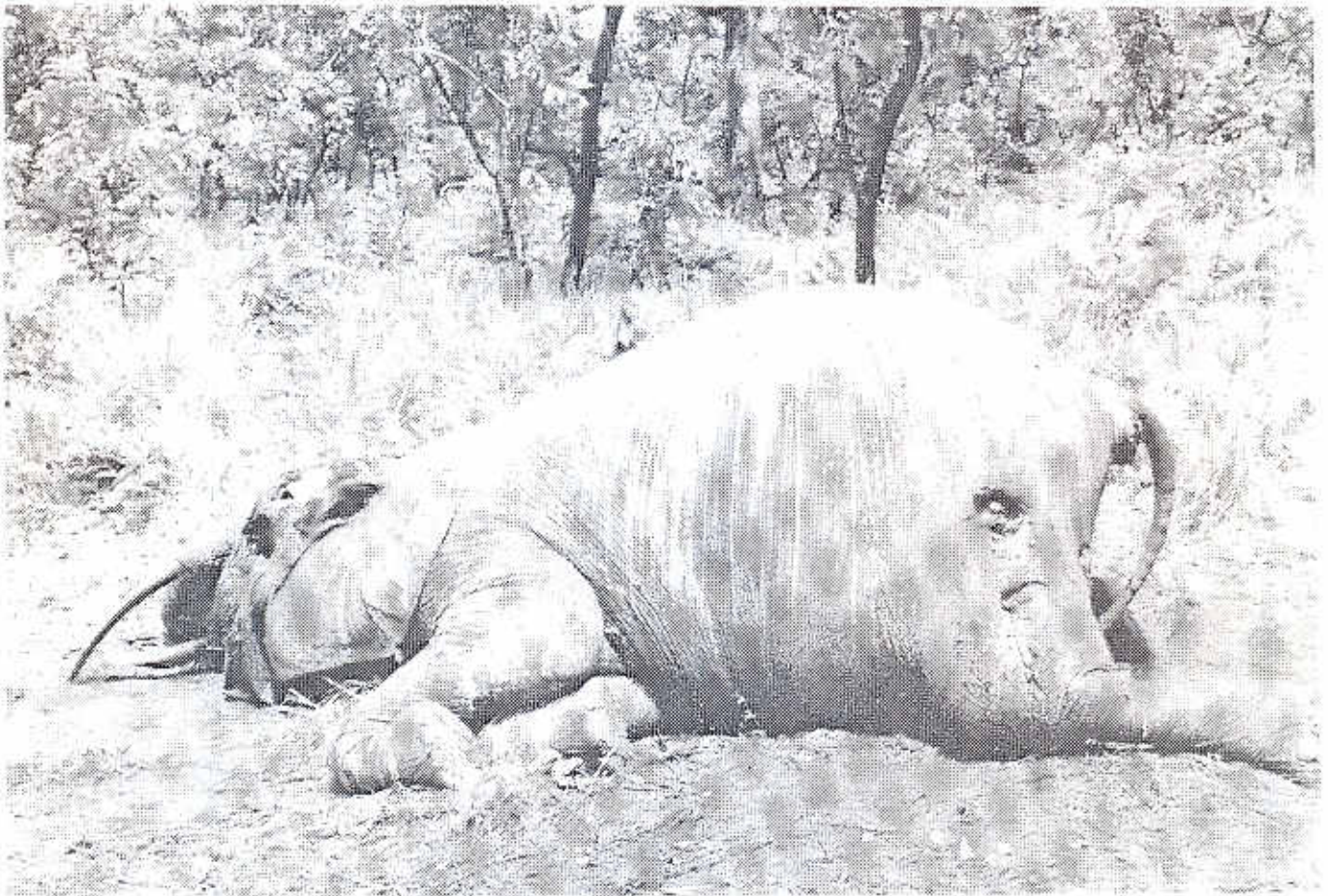
Dead Elephant in Central African Republic