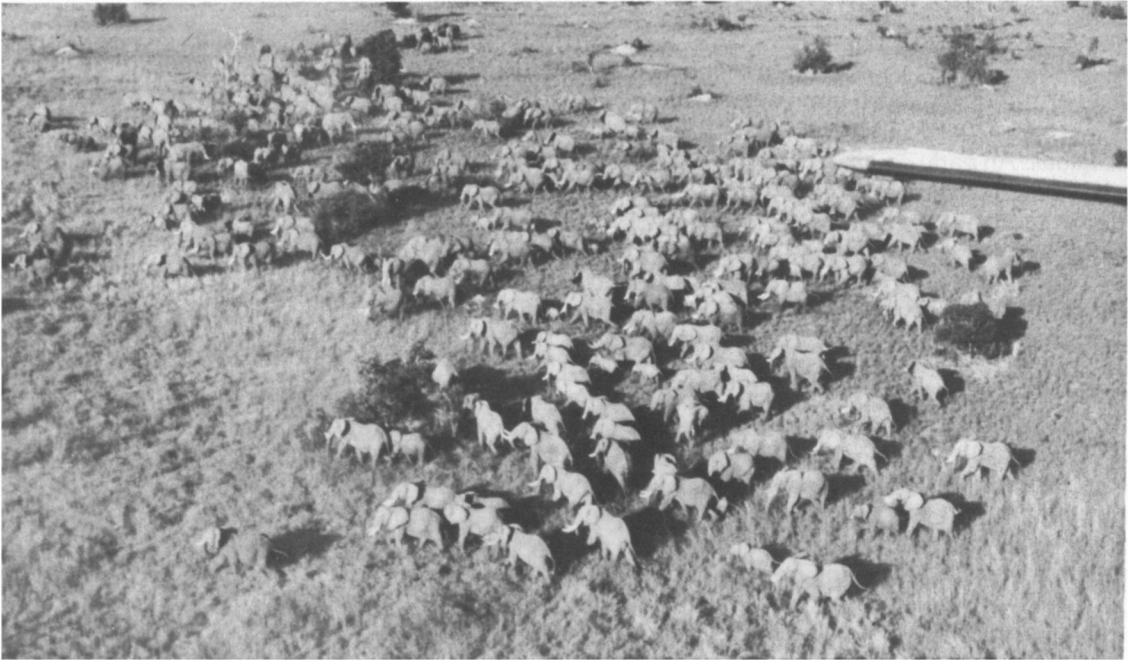
Doomed herd of elephants south of the Nile, Murchison Falls National Park, counted by the author in 1976. Virtually all these were killed by 1980.

effects of the recent civil war have not yet been assessed.