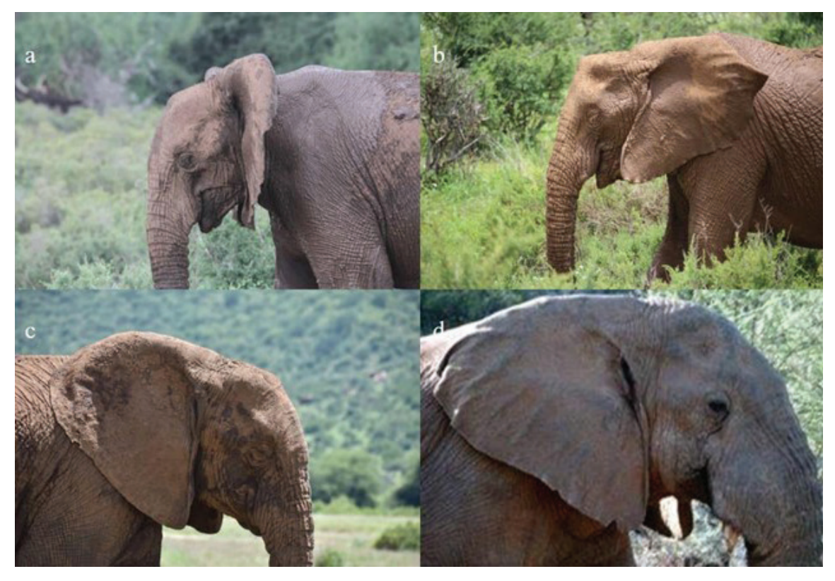
Figure 3. Close-up of the tuskless male S50.10 (a,c) evidencing the similarities and differences in tusk socket morphology with a tuskless female (b), and the differences with an adult male who had lost his tusks due to trauma (d).

An alternative explanation is that the observed male is truly congenitally tuskless and that this is an inherited trait. This is supported by the fact that his mother (coded as S50 or Kauai) is also tuskless (Fig. 4). However, this contradicts the findings of Campbell-Staton et al. (2021) on the lethality of the dominant X-linked tuskless allele for male offspring tespecially since three of the four known calves of S50 are males (and all tusked except S50.10), contrary to the expectations of female-biased sex ratios in the offspring of tuskless females. There are two potential paths to resolve such contradictions: (i) there could be other genetic mechanisms underlying male tusklessness, possibly varying among different African elephant populations and/or involving interactions between multiple genes driving phenotypic expression, as already proposed by Campbell-Staton et al. (2021); or (ii) the lethality of the dominant tuskless allele is not always complete and might sometimes allow