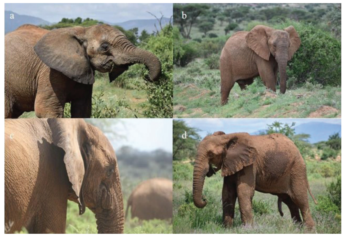
Figure 1. The tuskless male S50.10, photographed at different stages of his life: (a) 2016 (6 years old), (b) 2021 (11 years old), (c) 2022 (12 years old), and (d) 2023 (13 years old).

Parker 2023). Similarly, a comprehensive review of data from 15 elephant populations across eastern and southern Africa did not find any evidence for bilaterally tuskless males (Steenkamp et al. 2021), and bilateral male tusklessness seems to be absent also from forest elephants (Loxodonta cyclotis) in Central Africa (A. Turkalo, pers. comm., 2023). The only documented case of a bilaterally tuskless male in Addo Elephant NP was the result of the loss of both tusks in fights (Hall-Martin 1987). According to Steenkamp et al. (2007), male bilateral tusklessness is very rare (one case out of 10,000 examined elephant pictures), and suggests that most, if not all, of the very few cases of bilateral tusklessness might derive from tusk loss due to trauma. The only other substantiated observations of tuskless males comes from South Luangwa NP (Zambia, n=2; Jachmann et al. 1995) and Queen Elizabeth NP (Uganda, 9.5% of all bulls examined; Abe 1996). A tuskless male was also observed in 2021 in Murchison Falls NP (D. Daballen, pers. comm., 2022); (Fig. 6). Since it