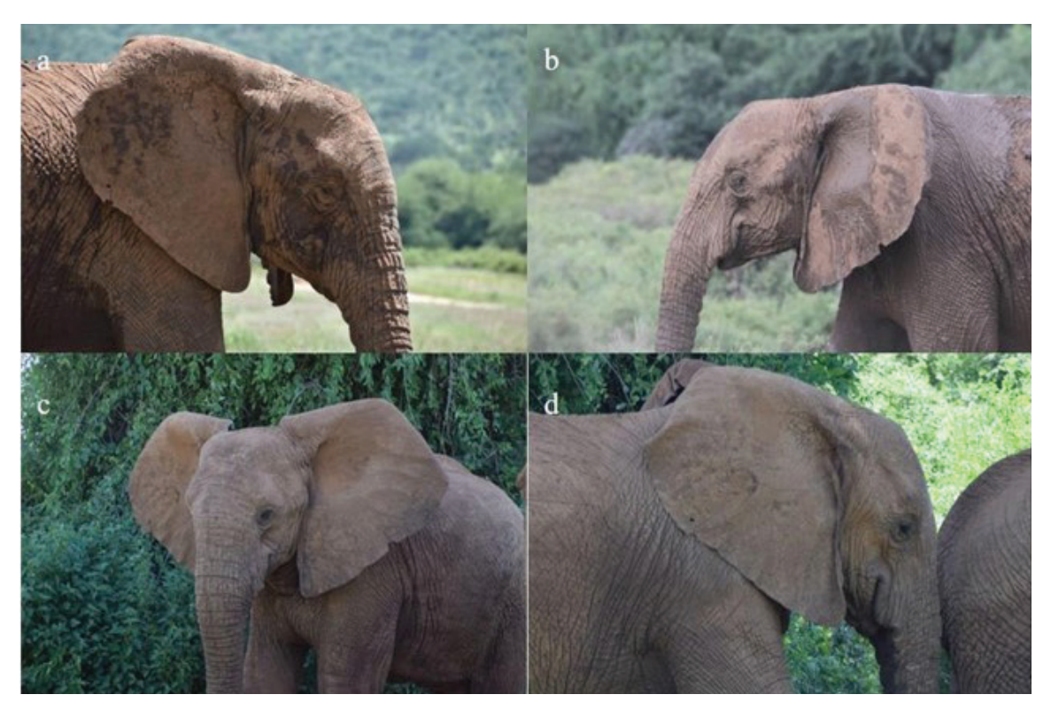
Figure 2. Morphological characteristics of the tuskless male S50.10 denoting the complete absence of tusks. The 'pinched face' appearance, characteristic of tuskless females, is very visible. Close-ups in lateral view (a, b), three-quarter front view (c, d), and three-quarter rear view (e, f), from pictures taken in 2013, when the individual was 13 years old.

that bilateral tusk growth and subsequent breakage at such a young age and between observations was unlikely to go unnoticed. Second, the morphological features of the male face closely mirror those of congenitally tuskless females, based on the examination of close-up pictures. S50.10 presents the characteristic 'pinched' appearance of tuskless females in frontal view, indicating the absence of tusk roots (Fig. 2). His symmetrical appearance makes it improbable that he was unilaterally congenitally tuskless and lost the other tusk to trauma. The morphology of the tuskless male is different from that of an adult male in the Samburu study population who lost his tusks due to trauma during his lifetime: in the latter, tusk sockets are visibly swollen, denoting the presence of tusk roots, with the base of the tusks still slightly protruding from the upper lip (Fig. 3). Finally, potential bilateral tusklessness due to trauma is most likely due to intense fighting, for which the study individual was too young (the age at first full musth is usually around 30 years; Hall-Martin 1987; Poole 1989; Goldenberg et al. 2014).