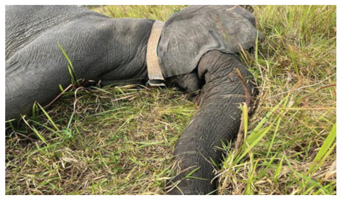
Figure 6. A tuskless adult male elephant, immobilized during collaring operations by Save the Elephants and the Uganda Wildlife Authority team in Murchison Falls National Park (Uganda). The tusk sockets proved to be empty upon manual inspection by David Daballen (co-author of this study), suggesting congenital tusklessness in this individual.